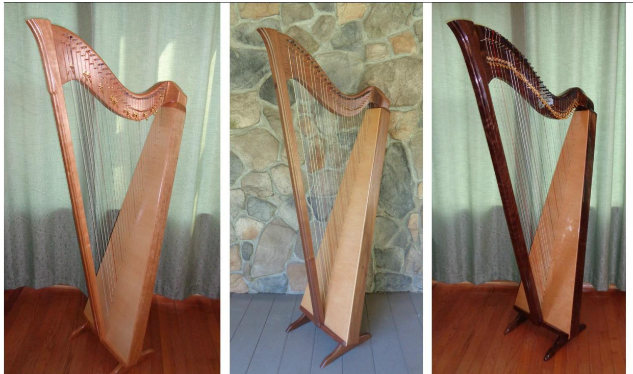
31-Hallel (cherry, high-gloss)

What kind of finish do you use on these harps?