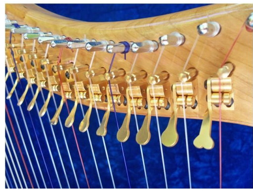
Gold Truitt Levers

What kind of levers are available for these harps?