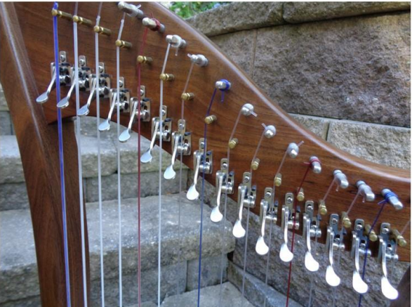
Silver Rees Levers Note: You can get a full set of levers or partial (such as C+F's or C,F+B) For prices see order form.

We can also put blue and red Bands on the C+Fs on the gold Forte and silver Rees levers. The Forte also provide red and blue levers for the C+F's upon request.